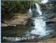
Photograph pix 1

The undulating topography, calm serenity and bountiful nature - the cathedral like silence of dense forests, bird calls and wild life , beautiful flora and