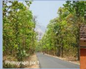
Photograph pix 1

fauna, picturesque hills and hillocks, waterfalls, rivers, rivulets and streams make Purulia a truly charming place to visit and enjoy. In 1805, a jungle Mahals district composed of 23 Parganas and mahals including the present Purulia was formed.