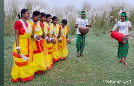
Photograph pix 1

The most attractive places to visit in Purulia are the natural old growth forests of Ajodhya, Matha and Kulipal. The cascading water falls like Bamni, Thurga and Dauri Khal. The pristine tribal habitations of Ajodhya and Bagmundih. Great and picturesque dams like Panchet, Murguma, Keshto Bazaar and Koyrabera.