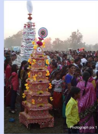
Photograph pix 1