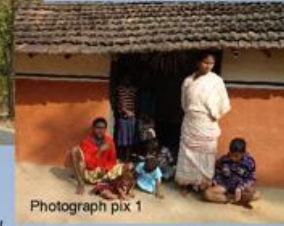
Photograph pix 1

In 1833 the jungle Mahals district was broken up and a new district called Manbhum was constituted with headquarters at Manbazar. Finally in 1956 Manbhum district was partitioned between Bihar and West Bengal and the present district Purulia was born on 1st November, 1956.